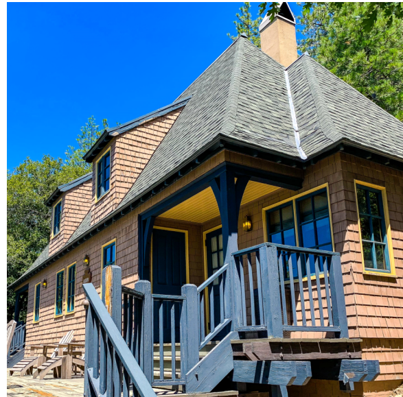
9) Exterior Elevation Photo