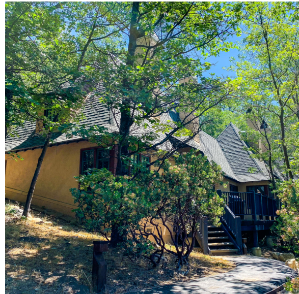
9) Exterior Elevation Photo