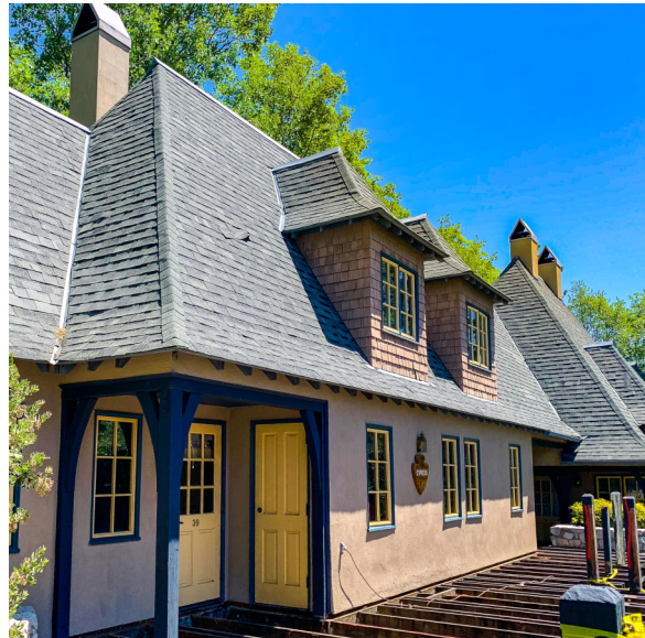
9) Exterior Elevation Photo