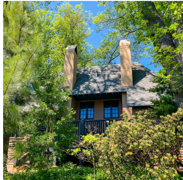
9) Exterior Elevation Photo