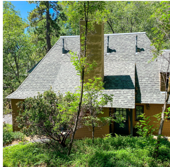
9) Exterior Elevation Photo