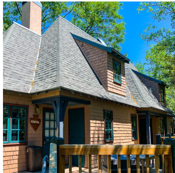
9) Exterior Elevation Photo