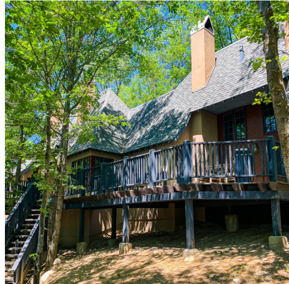
9) Exterior Elevation Photo