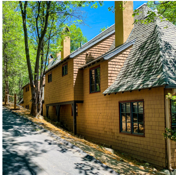
9) Exterior Elevation Photo