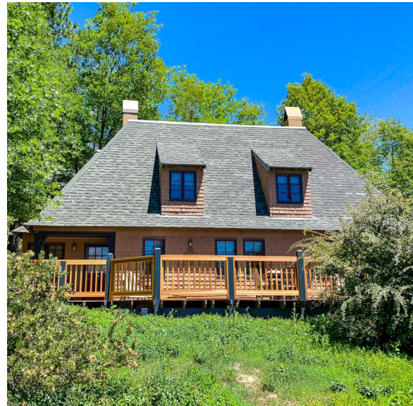
9) Exterior Elevation Photo