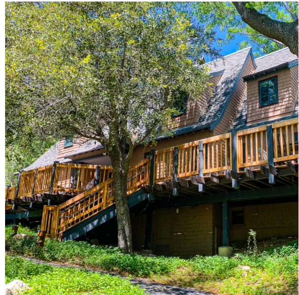
9) Exterior Elevation Photo