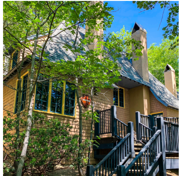
9) Exterior Elevation Photo