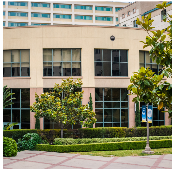
9) Exterior Elevation Photo