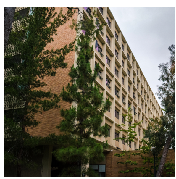
9) Exterior Elevation Photo