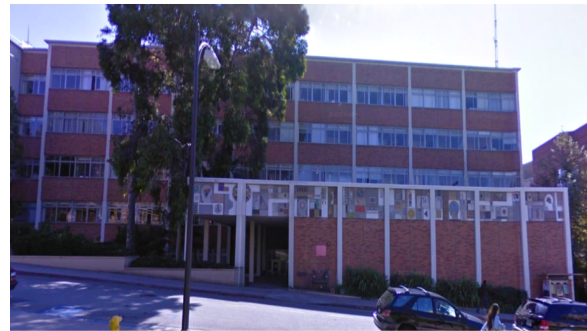
8) Plan Image or Aerial Photo