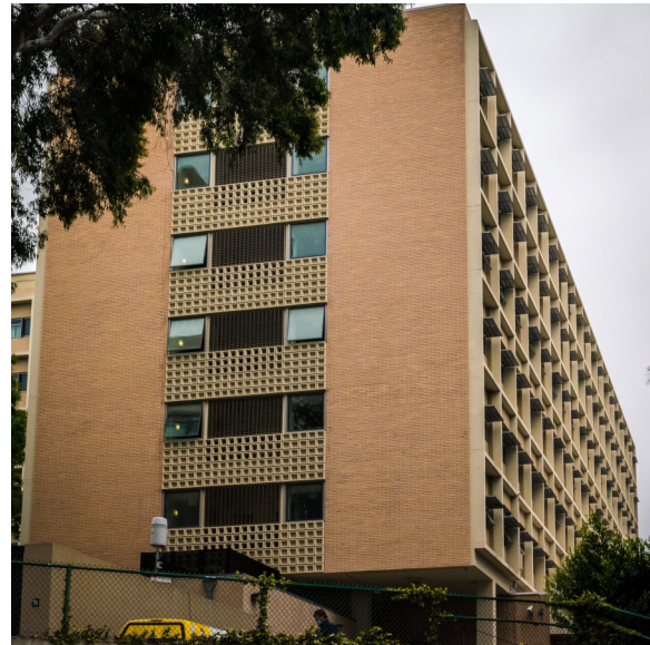
9) Exterior Elevation Photo