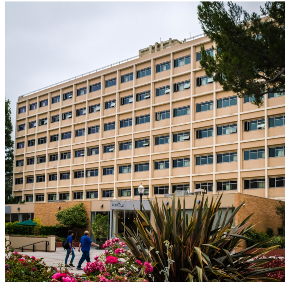
9) Exterior Elevation Photo