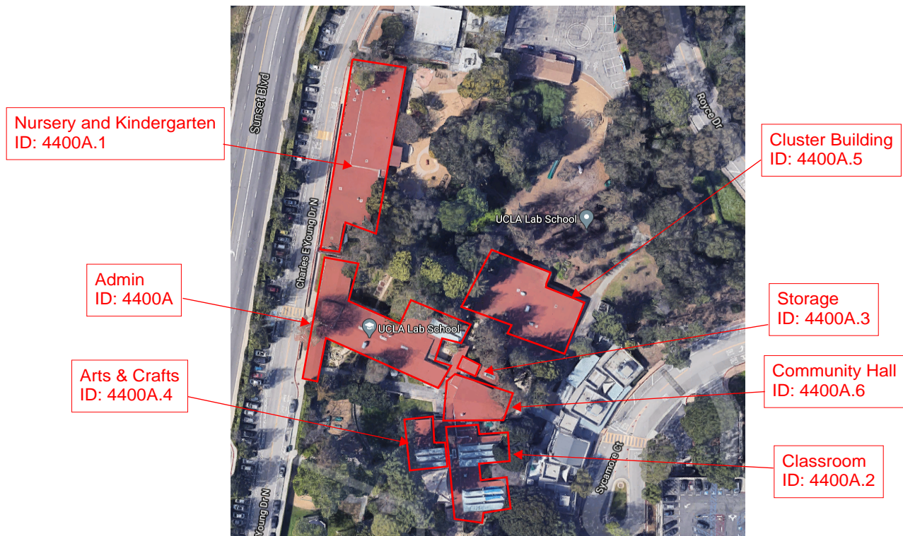
Figure 1 Key Plan of the Lab School 1 complex

The Lab School 1 complex is composed of multiple buildings. Each building is separated by several seismic separations allowing the different segments of the complex to act independently of one another. Shown below is a key plan of the complex along with the distribution of Building ID's at the complex.