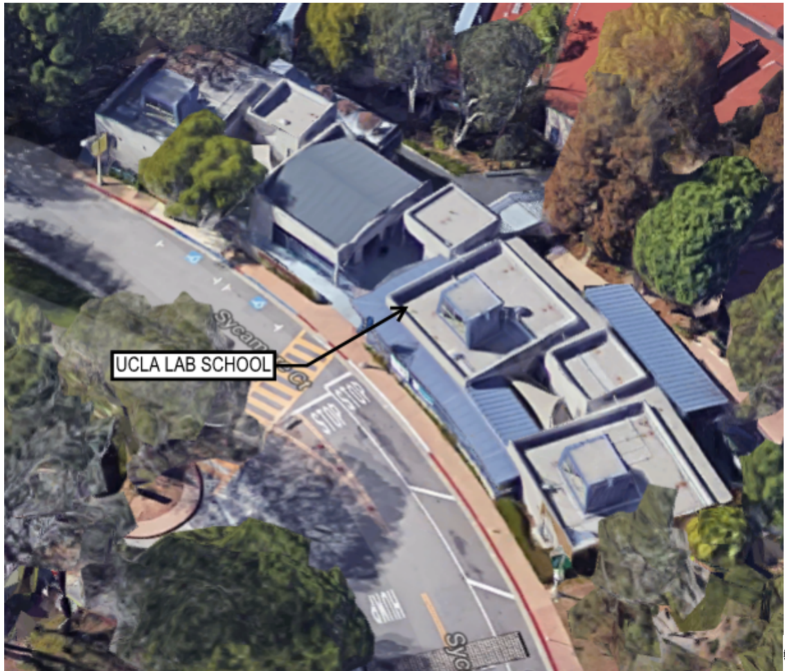
Figure 4.10.1 Lab School, UCLA

4.10.1 Building Description and Building Type: The UCLA Lab School is a two-story building, with twelve feet story height and approximately 11,655 sq. ft. plan area. The building extends approximately 220 ft. in the north-south direction and 50 ft. in the east-west direction.