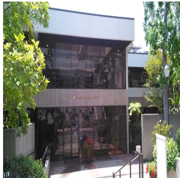
9) Exterior Elevation Photo