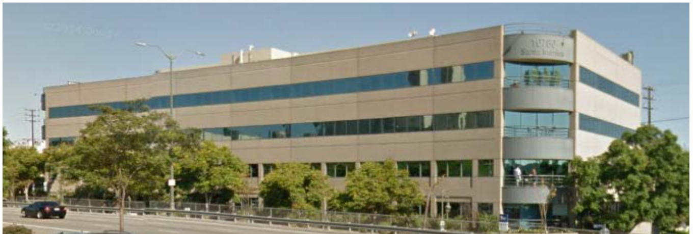
Figure 1 – North and west elevation of 10780 Santa Monica Boulevard in Los Angeles, CA.

The structural drawings available for and the basis of the review included S-2 to S-14 and S-16 with various dates between 04/02/82 and 01/25/84 and prepared by Hillman, Biddison, and Loevenguth Structural Engineers. See Figure 1 below for photo of north and west elevation of the existing building.