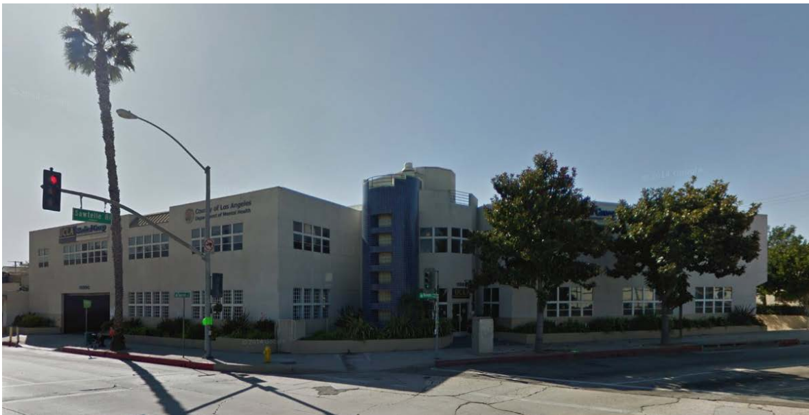
Figure 1 – South east elevation of 11303 Washington Boulevard in Los Angeles, CA.

See Figure 1 below for photo of south east elevation of the existing building.