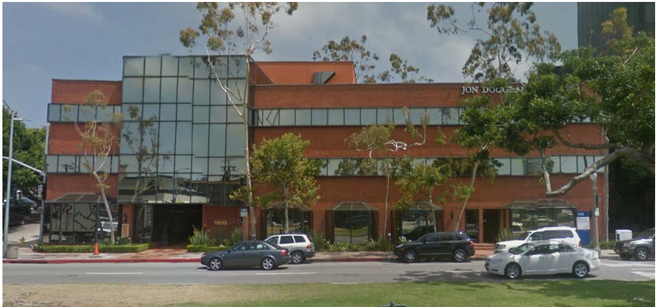
Figure 1 – North Elevation of 11633 San Vicente Blvd in Los Angeles, CA.

The structural drawings available for and the basis of the review included S-1 to S-8, dated 12/20/1984, and prepared by Thompson and LaBrie Structural Engineers.