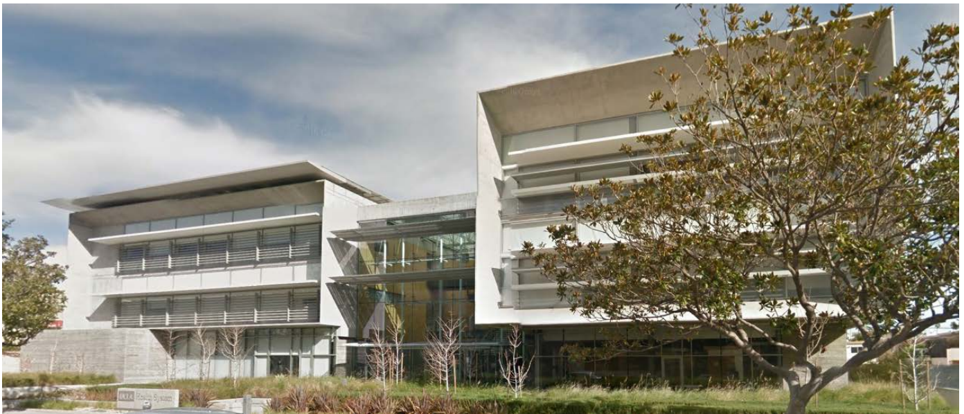
South west elevation of 1223 16 th Street, Santa Monica, CA

See below photo of the subject existing building.