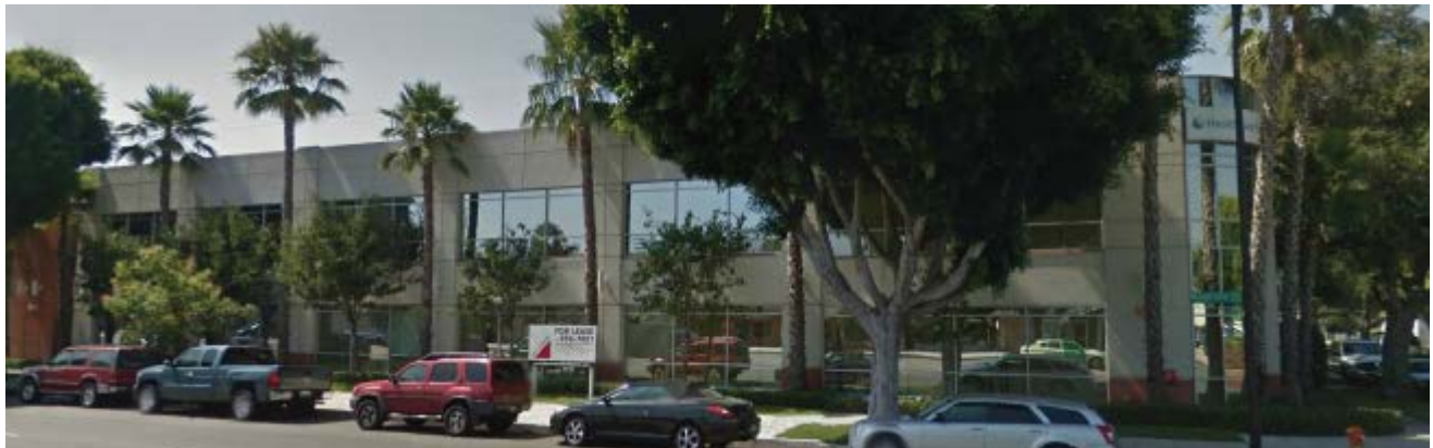
Figure 1 – Exterior View of 2211 Magnolia Blvd Building in Burbank

The building site is relatively level. The building is 87.5 feet by 199 feet in plan and consists of a basement floor below grade, first floor at grade, second floor, and roof. The perimeter above grade consists of non-load bearing steel stud and insulated architectural finish with reinforcing mesh wall panels with spandrel windows between the column areas.