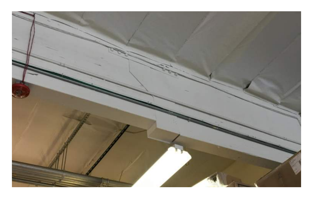
Figure 4 —Main girder continuity tie