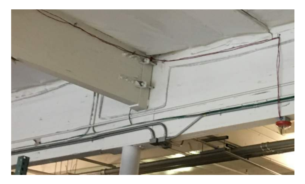
Figure 5 – Purlin to girder connection & continuity ties