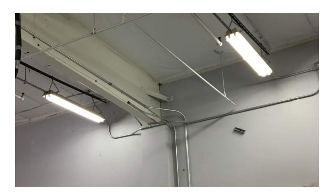
Figure 3 – Main girder to wall connection & anchorage