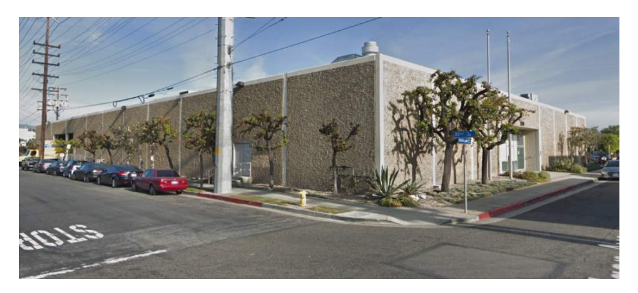
Figure 2 – Building Exterior (view from southern corner, intersection of Michigan Ave & 2nd St)

In general the exposed structural elements appeared to be in fair condition considering the age of the building. See Figures 2-5 below for photos from the site visit on February 13, 2019: