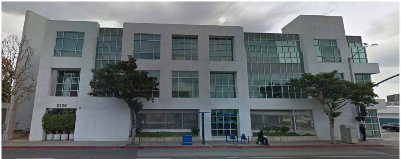
North elevation of 2336 Santa Monica Boulevard, Santa Monica, CA.

The structural drawings provided for review are titled "Parkside West Medical Center", prepared by William Dale Brantley Architects, and dated October 15, 1988. See photo below of the subject existing building.