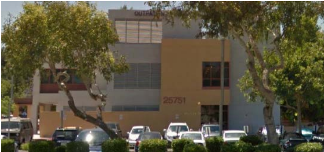
Figure 1 – Exterior View of 25751 McBean Parkway in Valencia, CA

The building is L shaped and consists of a first floor at grade, second and third floors, and roof. The perimeter wall consists of non-load bearing steel stud and architectural finish with spandrel windows between the column areas.