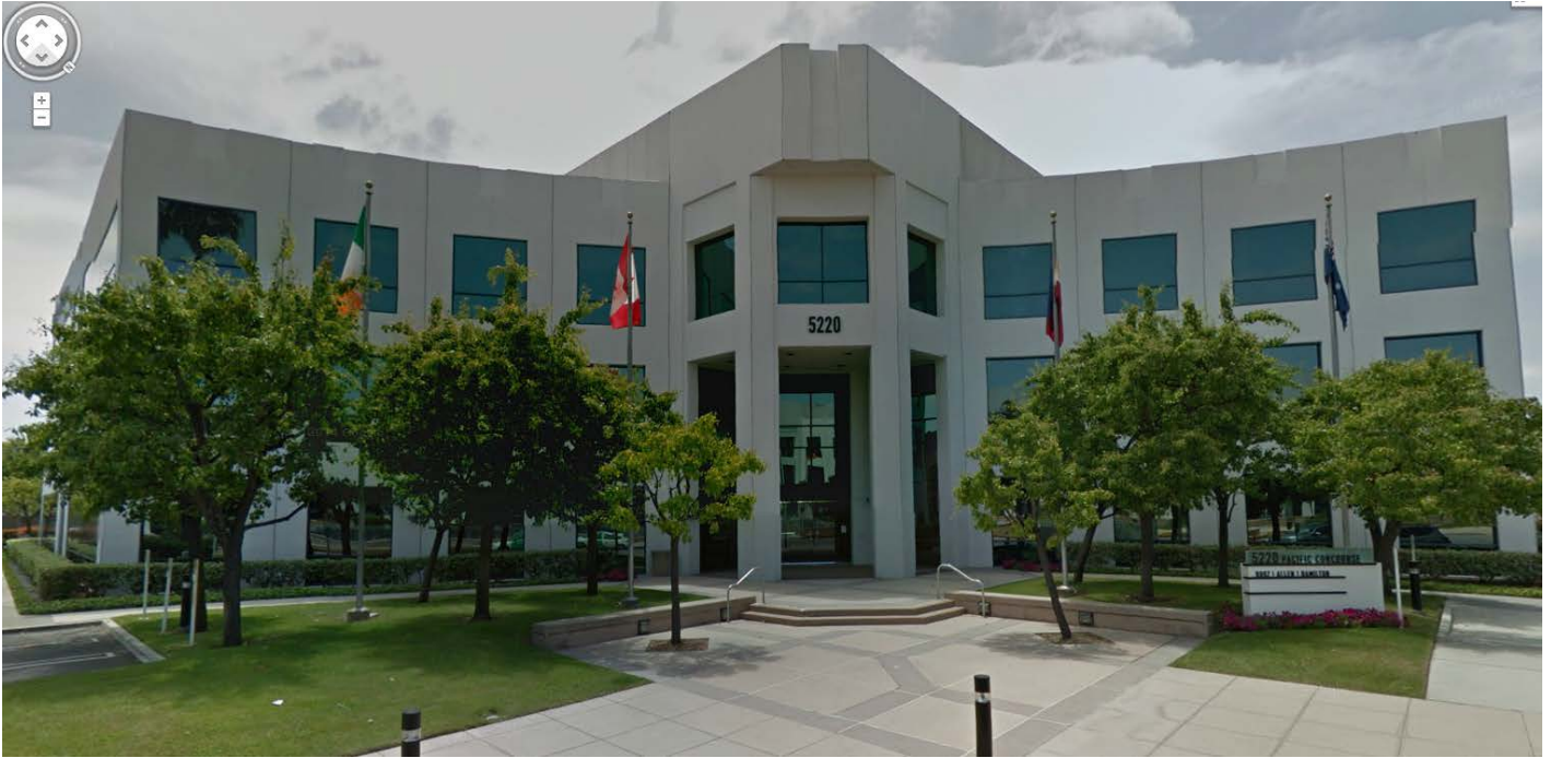
Figure 1 – Elevation of 5220 Pacific Concourse Drive, Los Angeles, CA.