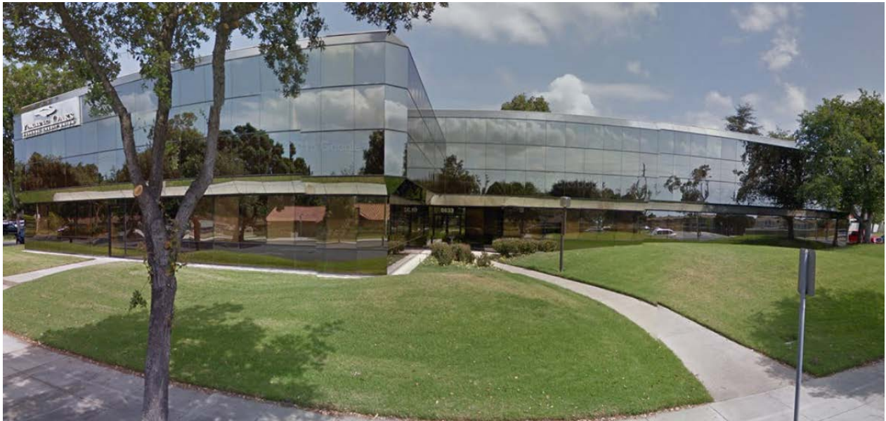
Figure 1 – South east elevation of 6633 Telegraph in Ventura, CA.

See Figure 1 below for photo of south east elevation of the existing building.