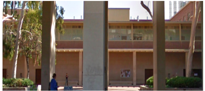
9) Exterior Elevation Photo