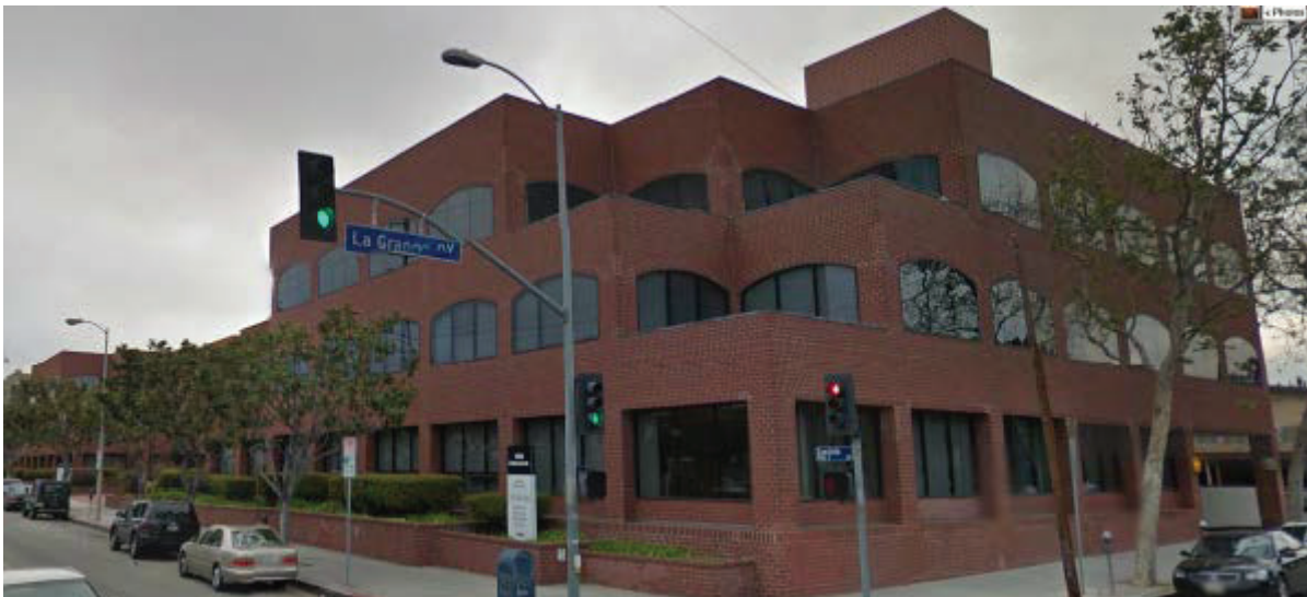
Figure 1 – Exterior View of 1950 Sawtelle Boulevard in Los Angeles, CA

The horizontal lateral system above the first floor and at the second and third floors and roof consists of the concrete and steel deck concrete diaphragms that transfer seismic forces to the vertical lateral system that consists of Pre-Northridge Earthquake steel special moment frames that consist of steel wide flange beams and columns located at interior and perimeter column bays above the first floor.