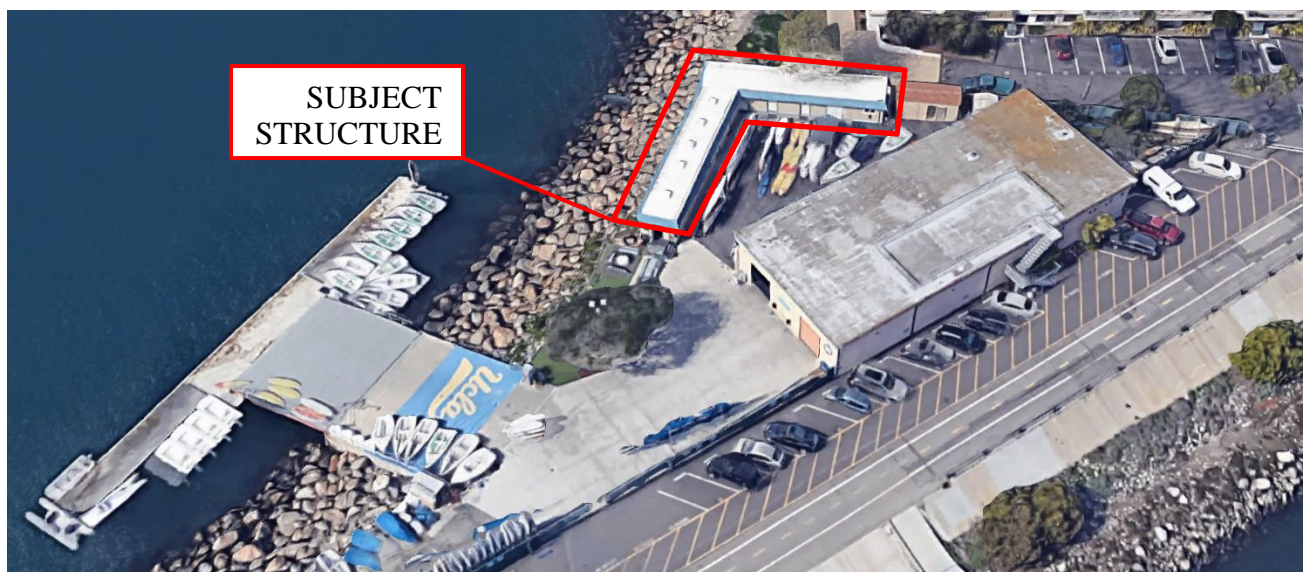
Figure I. View of Overall Subject Existing Building Site

The existing, single-story, modular trailer comprised unit consists of around 1,470 square feet of occupiable space. The footprint of the structure is oriented in an 'L' configuration, approximately 12 feet wide throughout and has outermost dimensions measuring 75 feet by 65 feet. The structure consists of two lightweight, wood framed, mobile trailer units joined at the ends. The structures' ASCE model building type most closely aligns with type W2. See Figure I below for an overall image of the subject existing building site.