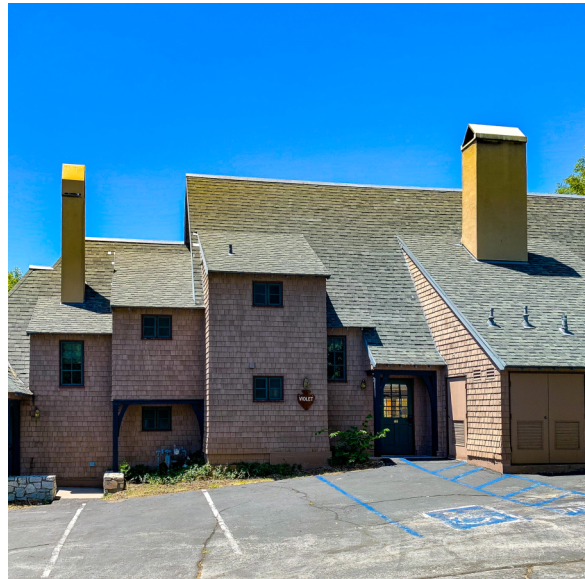
9) Exterior Elevation Photo