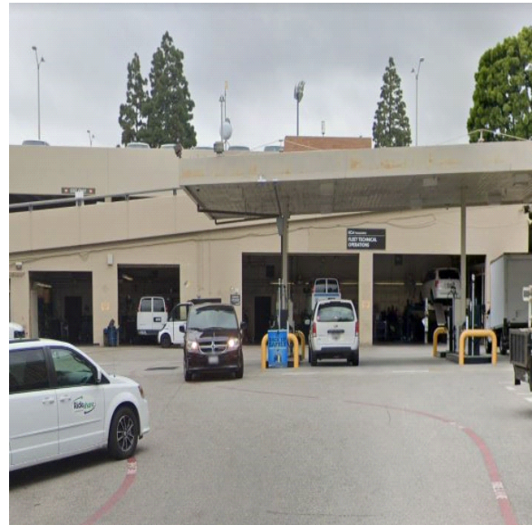
9) Exterior Elevation Photo