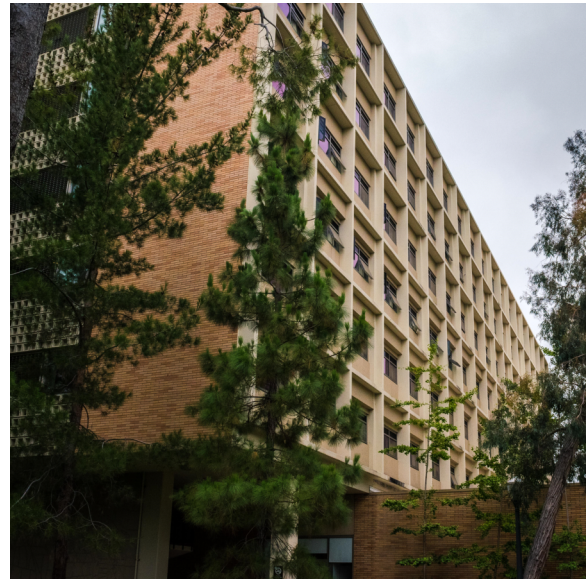
9) Exterior Elevation Photo