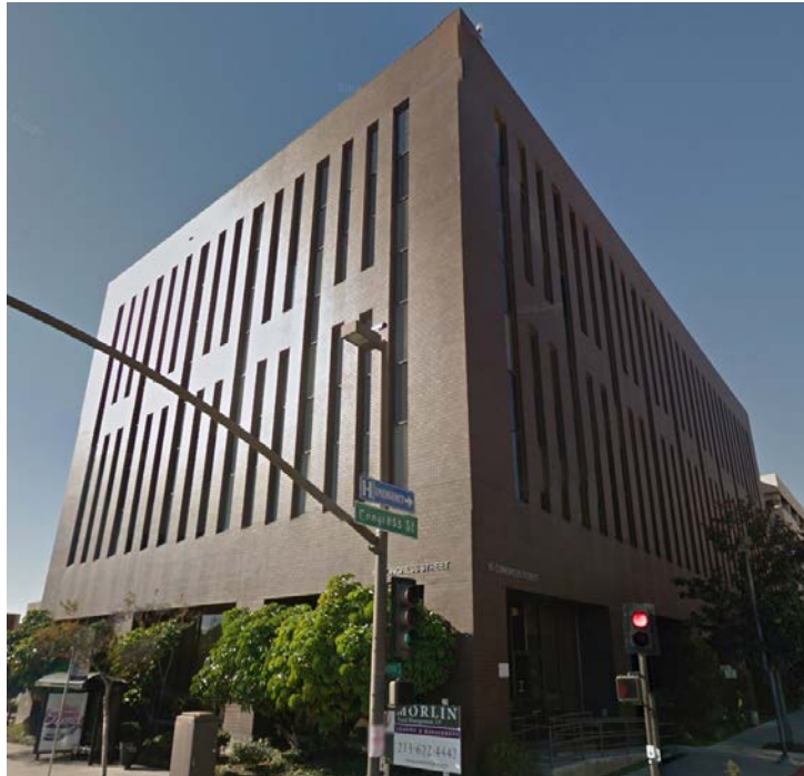
Northeast elevation, 10 Congress Street, Pasadena, CA

The structural drawings were not available; however the steel shop drawings and some architectural drawings were available and viewed at the building. See below for photo of the northeast elevation of the subject existing building.