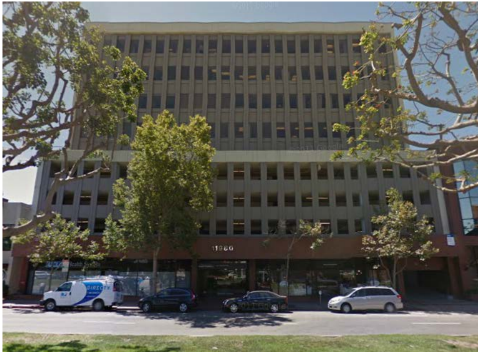
Figure 1 – North Elevation of 11980 San Vicente Blvd in Brentwood, CA

See Figure 1 for exterior elevation of the building. The available structural drawings are the basis of the review and included S-1 to S-18 titled Brentwood Medical Center, dated 10/30/1972, and prepared by Kelly Pittelko Fritz and Forssen Consulting Engineers.