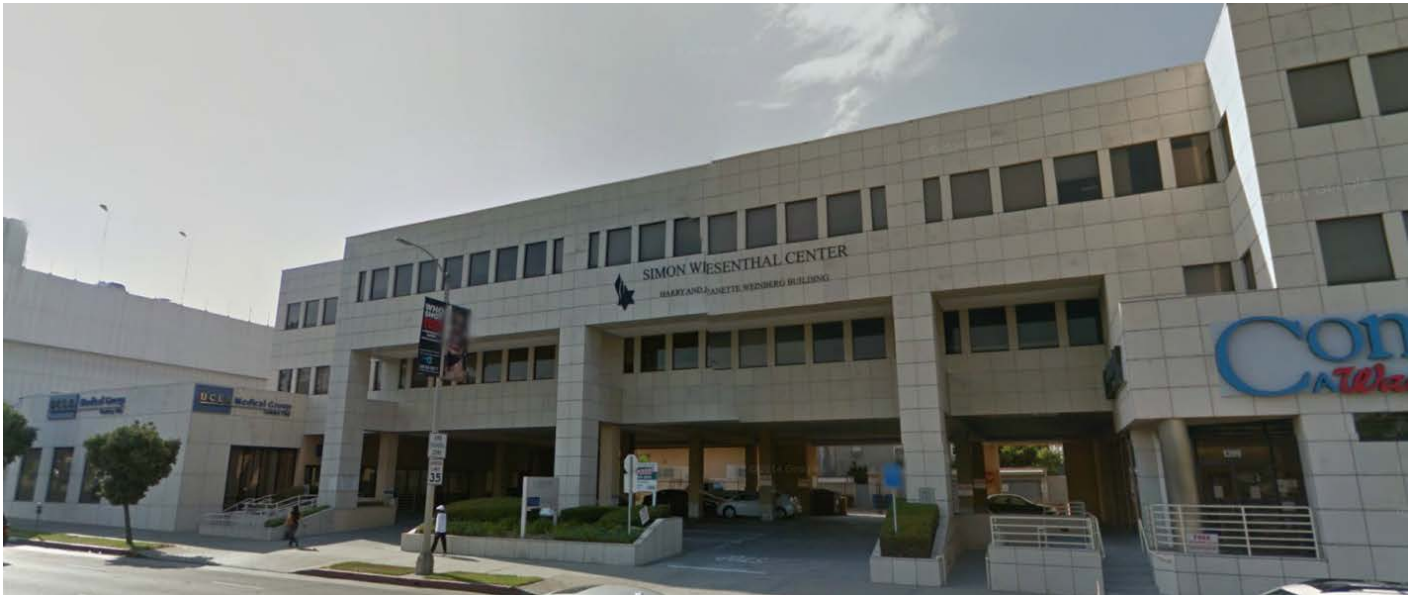
Figure 2 – South elevation of 1399 S. Roxbury Drive in Angeles, CA. Note portion occupied by UCLA on left (west) side in one story portion.