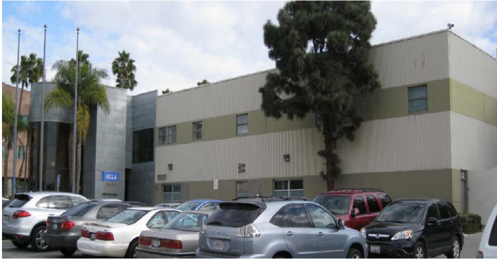
Figure 1 – Exterior View of Two Story Portion