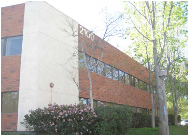
Figure 1 – Exterior View of 2100 Lynn Road Building in Thousand Oaks, CA.

The drawings available for review were A-1 to A-12, prepared by Stephen U. Gassman, AIA, dated 11/05/1986, and the basis of this report.