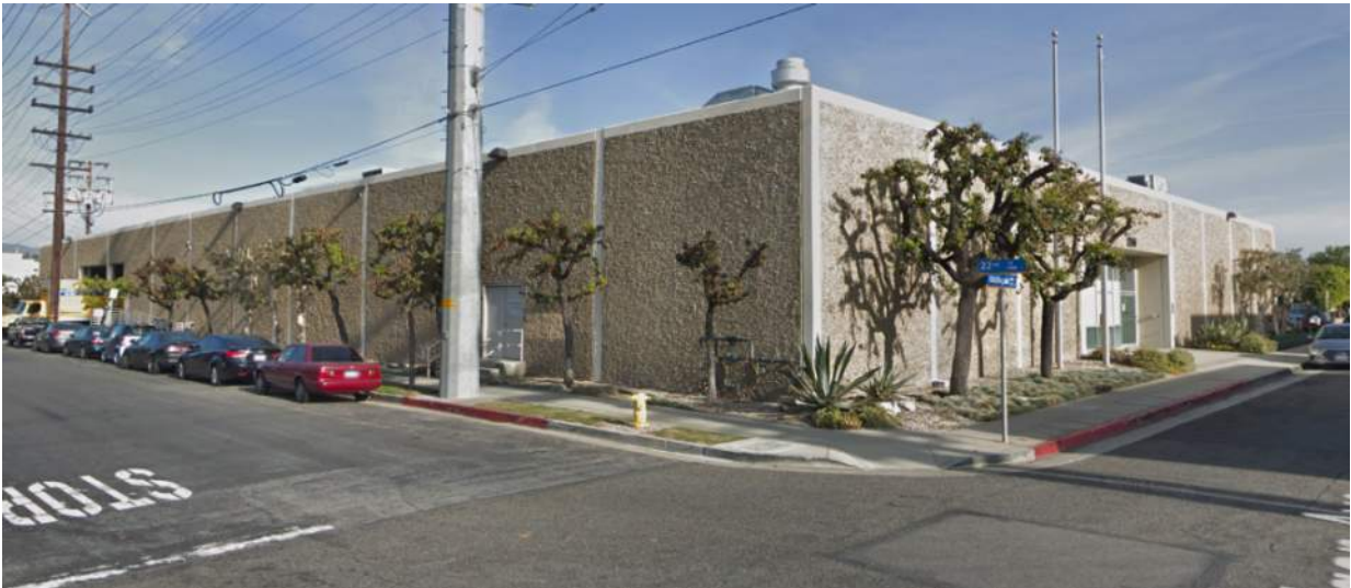
Figure 2 – Building Exterior (view from southern corner, intersection of Michigan Ave & 2nd St)

In general the exposed structural elements appeared to be in fair condition considering the age of the building. See Figures 2-5 below for photos from the site visit on February 13, 2019: