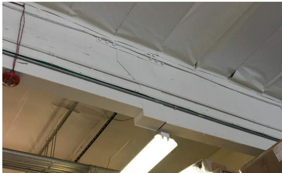
Figure 4 –Main girder continuity tie