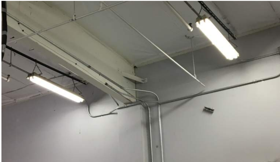
Figure 3 – Main girder to wall connection & anchorage