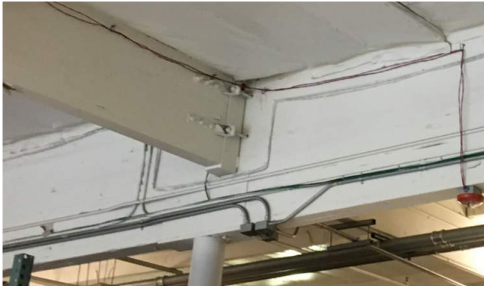
Figure 5 – Purlin to girder connection & continuity ties