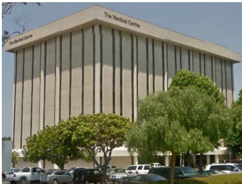
Figure 1 – Southeast Elevation of 4201 Torrance Blvd in Torrance, CA.

The structural drawings available and the basis of the review included S-1 to S-8, dated 02/11/1974, and prepared by Steinbrugge and Thomas, Inc., Structural Engineering.