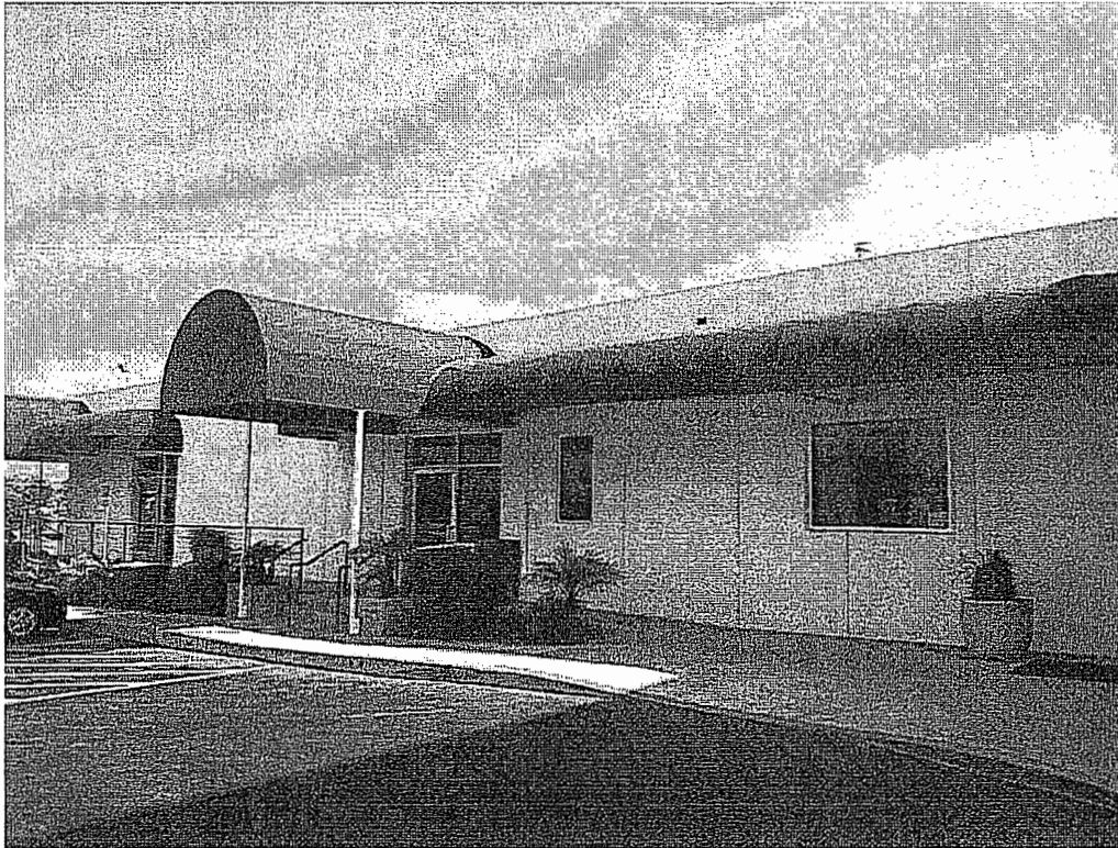
Northwest Elevation of 514 N. Prospect