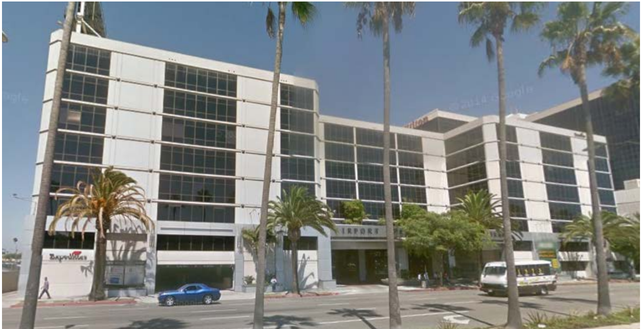
Figure 1 – 5757-5767 W. Century Blvd, Los Angeles, CA; Office Building #1 (South Building) South Elevation

The seismic and wind lateral load resisting system consists of the horizontal reinforced concrete slab diaphragms that transfer seismic and wind forces to the reinforced concrete shear walls.