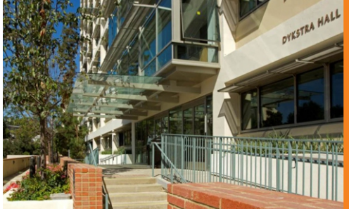
5 Dykstra Hall