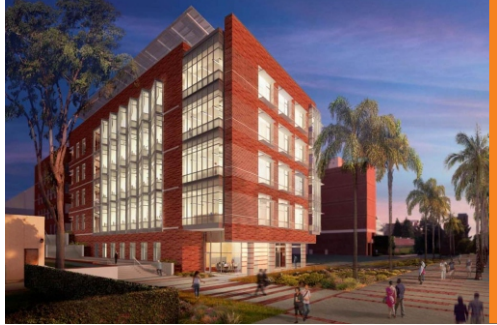
11 Engineering VI - Phase 1