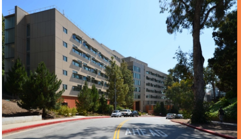
4 Holly & Gardena Halls