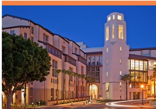
13 Weyburn Terrace