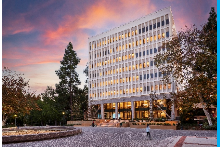
34 Pritzker Hall