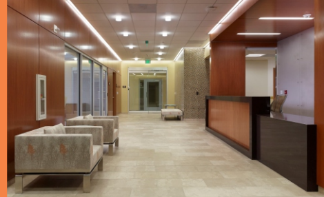
26 Clinical and Translational Research