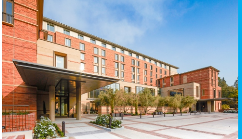
6 Meyer & Renee Luskin Conference Center