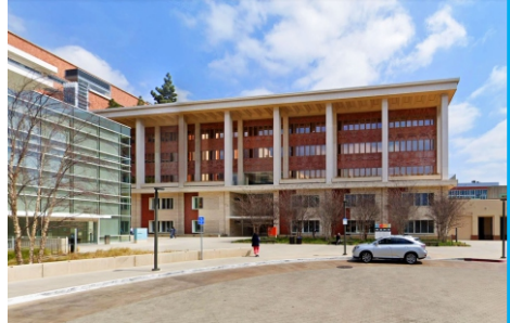
28 Jules Stein Eye Institute