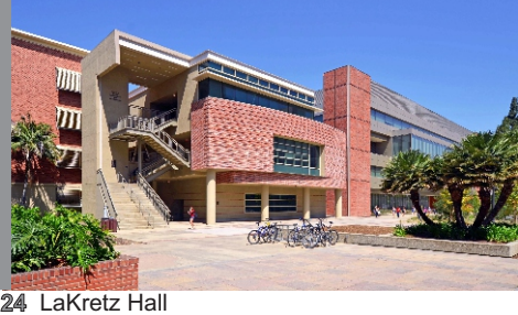
24 LaKretz Hall