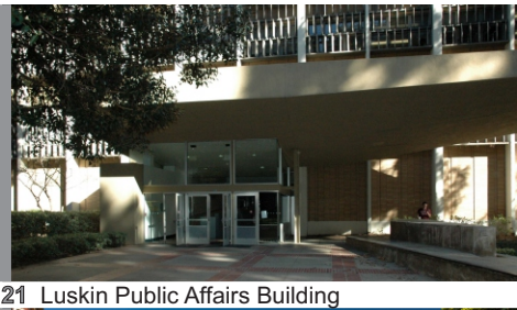
21 Luskin Public Affairs Building