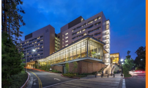
9 Sproul Halls