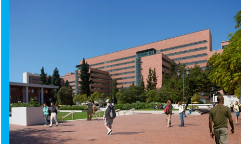
20 CHS South Tower