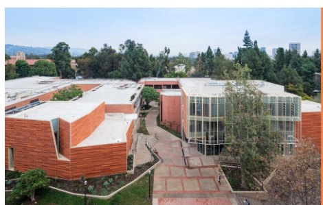
29 Ostin Music Center