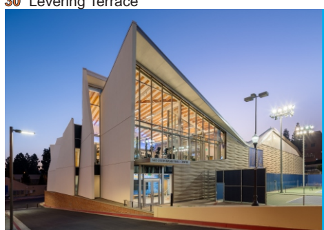
31 Mo Ostin Basketball Center