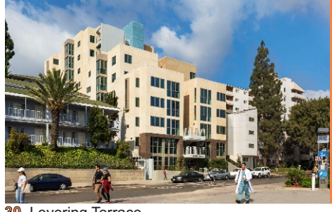
30 Levering Terrace