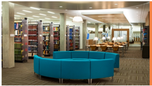
7 Young Research Library