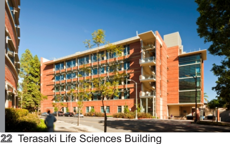
22 Terasaki Life Sciences Building