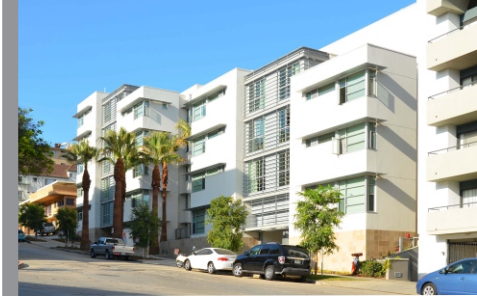
16 Glenrock Apartments