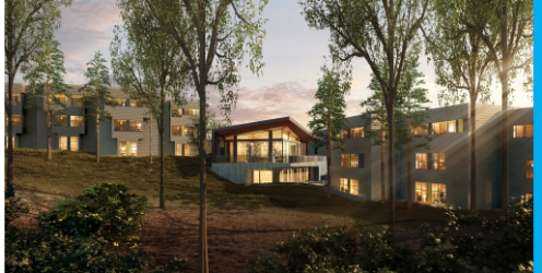
2 Hitch Commons