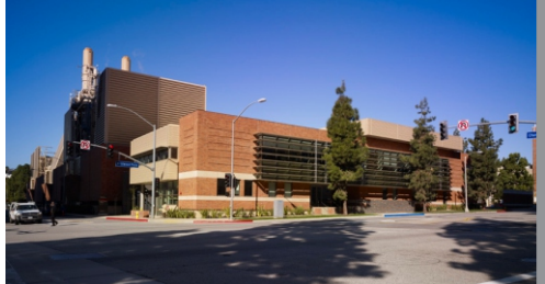
12 Police Station