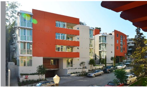
15 Landfair Apartments