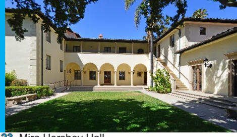
23 Mira Hershey Hall