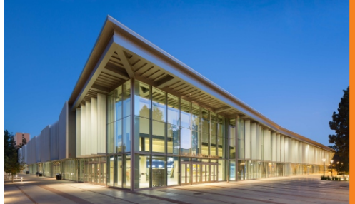
10 Pauley Pavilion