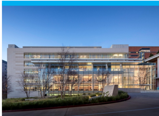
14 Edie and Lew Wasserman Building