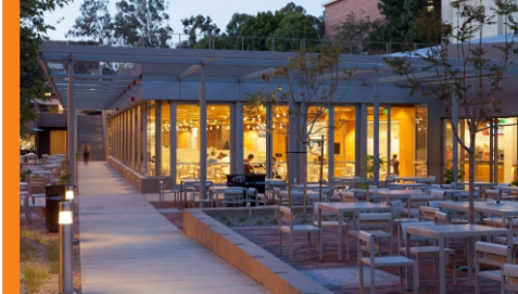
17 Court of Sciences Student Center