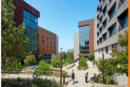
35 Olympic & Centennial Hall