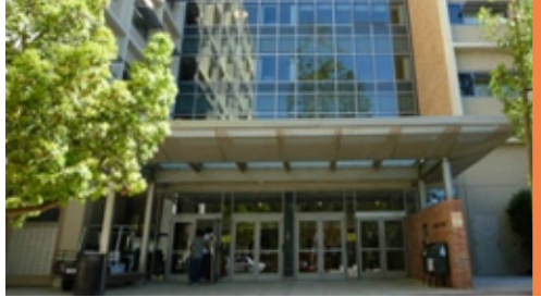
8 Hedrick Hall