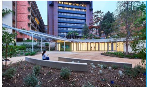
27 LaKretz Garden Pavilion