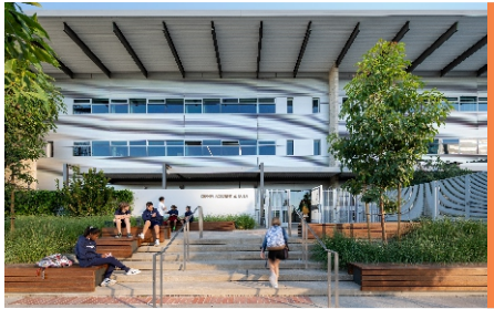
33 Geffen Academy