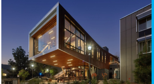
3 Saxon Residences