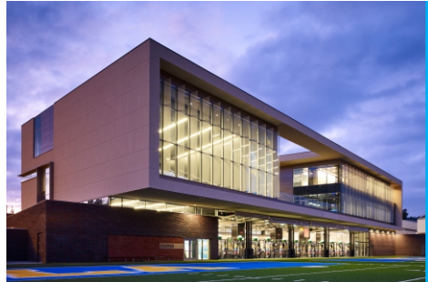
32 Wasserman Football Center