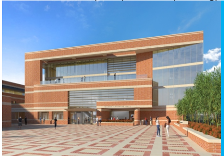
38 Marion Anderson Hall