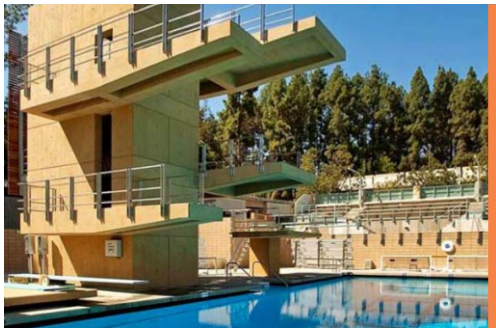
1 Spieker Aquatic Center