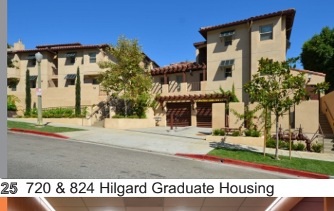
25 720 & 824 Hilgard Graduate Housing