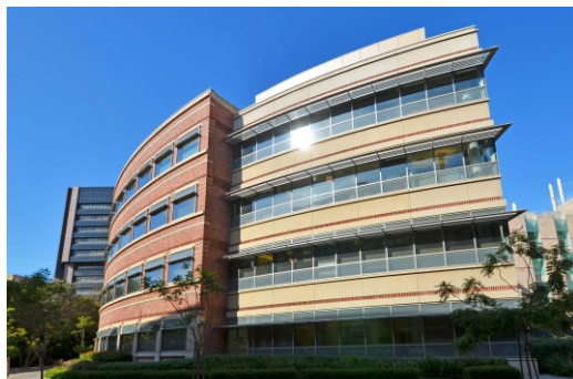
20 Biomedical Sciences Research Building Built: 2007 Architect: Cesar Pelli