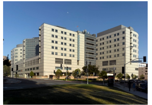
23 Ronald Reagan UCLA Medical Center Built: 2008 Architect: Pei Partnership Architects