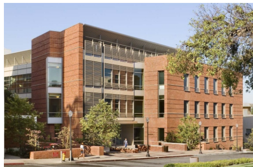
21 Engineering V Built: 2007 Architect: Anshen & Allen LA (CO Architects)