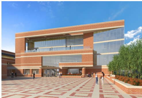
8 Marion Anderson Hall Built: 2017 Executive Architect: Pei Cobb Freed & Partners Design Architect: Gensler & Associates