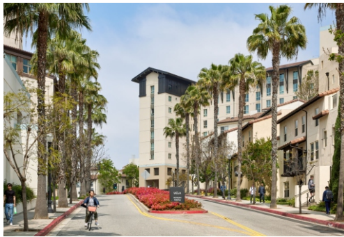
6 Southwest Campus Apartments Built: 2018 Architect: Mithun