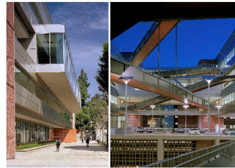
22 California NanoSystems Institute Built: 2007 Architect: Rafael Vinoly Architects