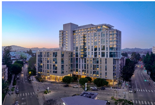
7 Gayley Heights Built: 2018 Architect: Studios Architecture