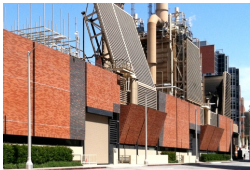
9 Co-generation Plant Built: 1994 Architect: Holt Hinshaw Pfau Jones