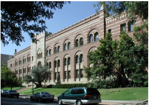
4 Humanities Building Built: 1930 & 1933 Architect: Alison & Alison Renovation: 2006 Architect: NBBJ, San Francisco