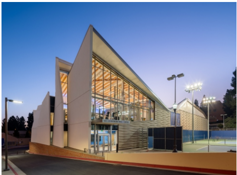
36 Mo Ostin Basketball Center Built: 2017 Architect: Kevin Daly Architects