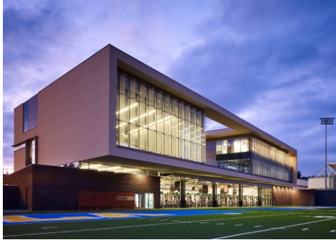
35 Wasserman Football Center Built: 2017 Architect: Zimmer Gunsul Frasca Architects