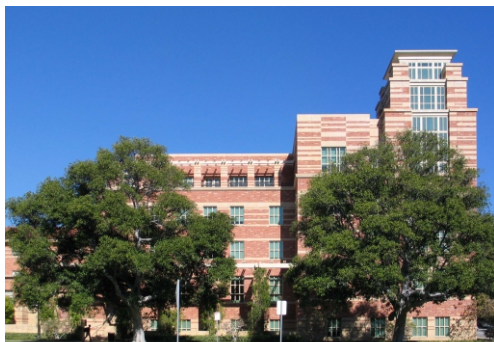
13 Law Library Addition Built: 1998 Architect: Moore Ruble Yudell