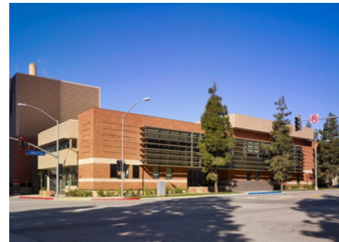
24 UCLA Police Station Built: 2009 Architect: Studios Architects