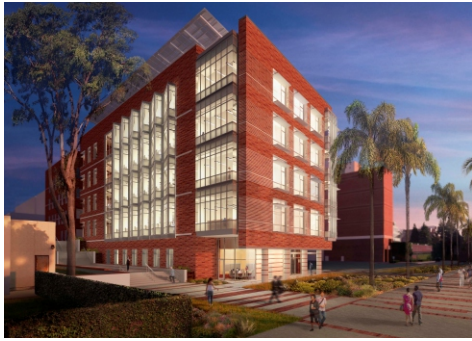
31 Engineering VI: Phase 1 Built: 2015 Architect: Moore Rube Yudell