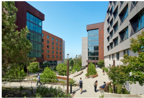
5 Centennial & Olympic Residence Halls Built: 2018 Architect: Mithun