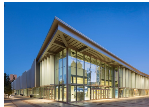
28 Pauley Pavilion Built: 1965 Architect: Welton Becket & Associates Renovation: 2012 Architect: NBBJ