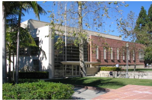
15 Morgan Center Built: 2001 Architect: Polshek Associates