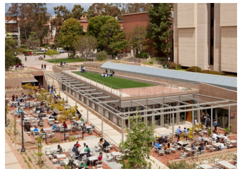
27 Court of Sciences Student Center Built: 2012 Architect: Safdie Rabines Architects