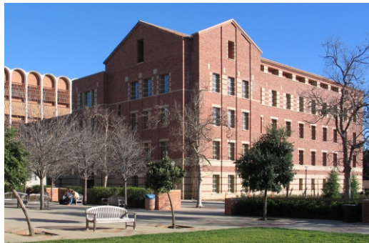
16 Physics & Astronomy Building Built: 2004 Architect: Anshen & Allen LA