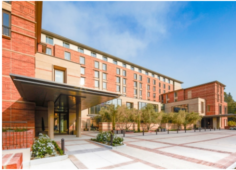
33 Meyer & Renee Luskin Conference Center Built: 2016 Architects: Hornberger + Worstell Bohlin Cywinski Jackson