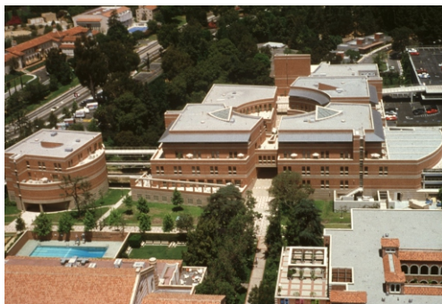
10 Anderson School of Management Built: 1995 Architect: Pei Cobb Freed & Partners