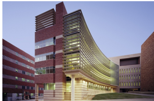
17 Neurosciences Building Built: 2004 Architect: Perkins & Will