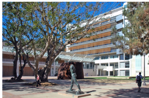
19 Broad Art Center Built: 1965 Architect: William Pereira & Associates Renovation: 2006 Architect: Richard Meier and Partners