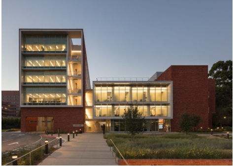
34 Geffen Hall Built: 2016 Architect: Skidmore, Owings & Merrill