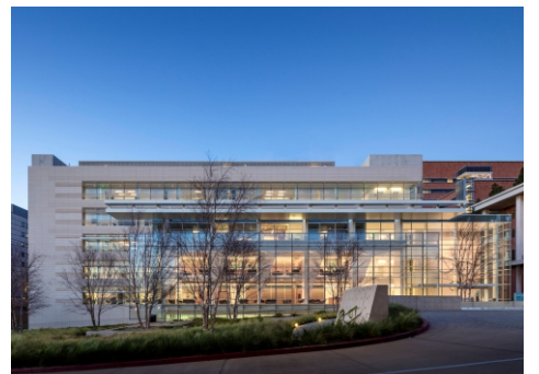
29 Wasserman Building Built: 2014 Architect: Richard Meier & Partners Architects