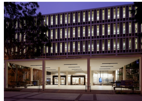
26 Young Research Library Built: 1964, 1971 addition Architect: Jones & Emmons 1st Floor Renovation: 2011 Architect: Perkins & Will