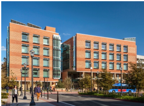
37 Engineering VI Phase 2 Built: 2017 Architect: Moore Ruble Yudell