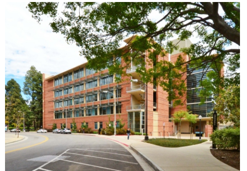
25 Terasaki Life Sciences Building Built: 2010 Architect: Bohlin Cywinski Jackson