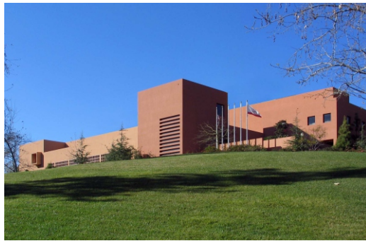
14 Tom Bradley International Center Built: 1998 Architect: Ricardo Legoretta