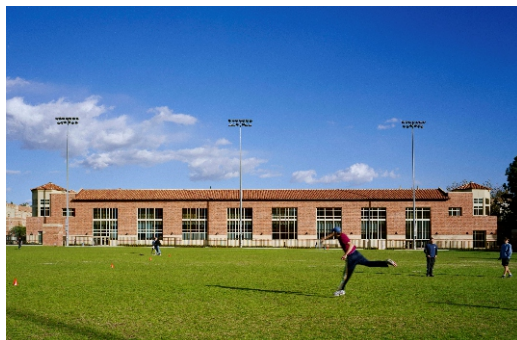
18 Wooden Center West Addition Built: 2005 Architect: Hardy Holzman Pfeiffer