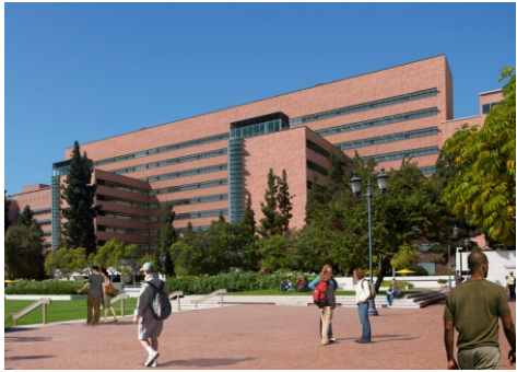
32 CHS South Tower Built: 1954 Architect: Welton Becket & Associates Renovation: 2015 Architect: Zimmer Gunsul Frasca