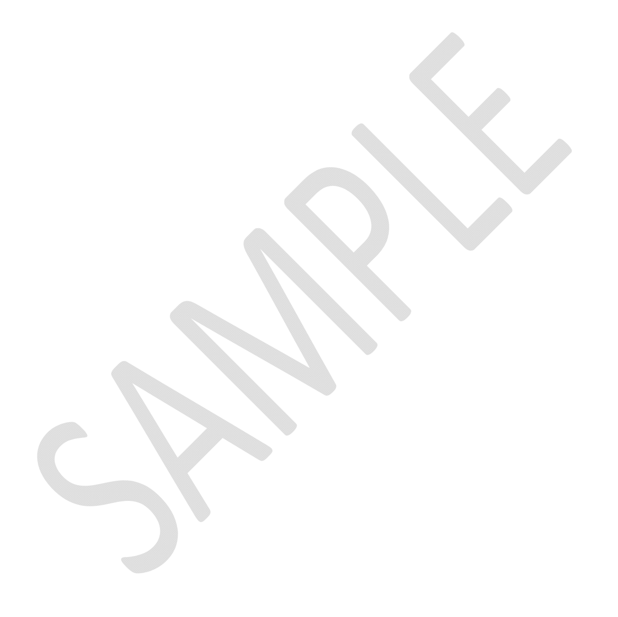
EXHIBIT B TO THE EXECUTIVE DESIGN PROFESSIONAL AGREEMENT DESIGN PROFESSIONAL RATE SCHEDULE FOR ADDITIONAL SERVICES